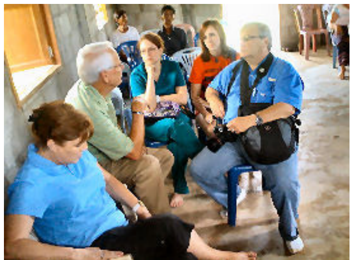
↓ Medical Team